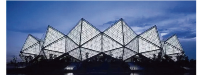
The 2011 Universiade in Shenzhen.