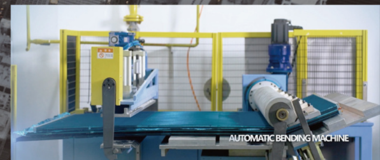
AUTOMATIC BENDING MACHINE

Hien is a leading brand in the Chinese heat pump industry, integrating product research and development, equipment production, sales, and service. Our products cover four major areas: cooling and heating, hot water, drying, and swimming pool heat pumps. We have the capacity to produce 1 million air source heat pumps annually, and we empower every stage of product manufacturing with advanced modern processing and manufacturing equipment.