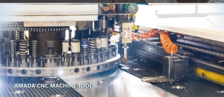
AMADA CNC MACHINE TOOL