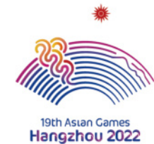
2023 the Asian Games in Hangzhou