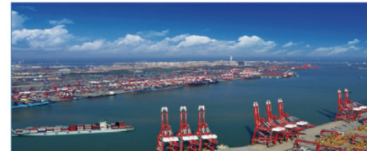
2016 the hot water reconstruction project of Qingdao port.