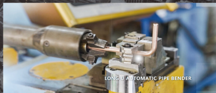
LONG U AUTOMATIC PIPE BENDER